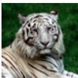
Cincinnati Zoo & Botanical Garden