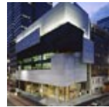
Contemporary Arts Center