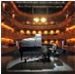
Cincinnati Aronoff Center for the Arts