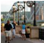
Newport on the Levee