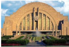
Cincinnati Museum Center