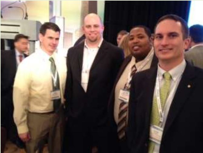
Leadership U participants at the Chicago Winter meeting.